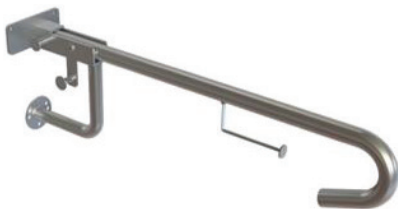
Lock Down/Up Grab Rail