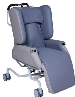
Pressure Management Chairs