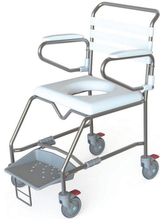
Example of a transit / attendant propelled commode with sliding footplate