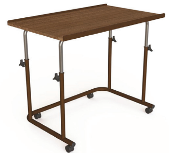
Over Chair Table