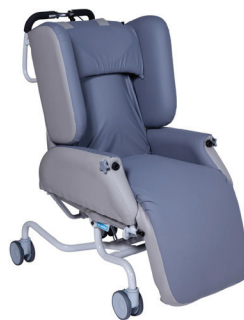
Pressure Management Chairs