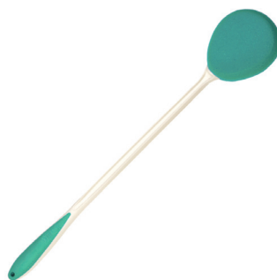
Long Handled Sponge