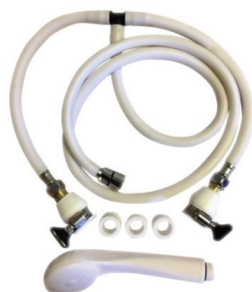
Hand Held Shower Hose