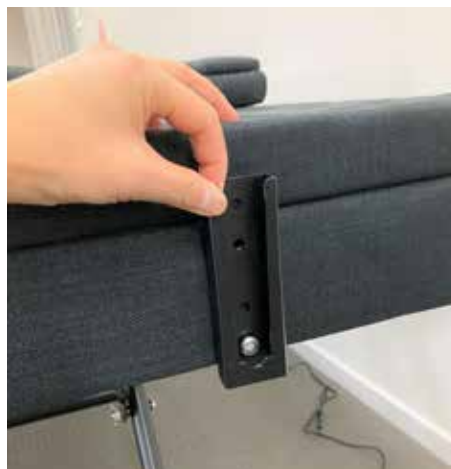
Place headboard mounting bracket bed piece (4)