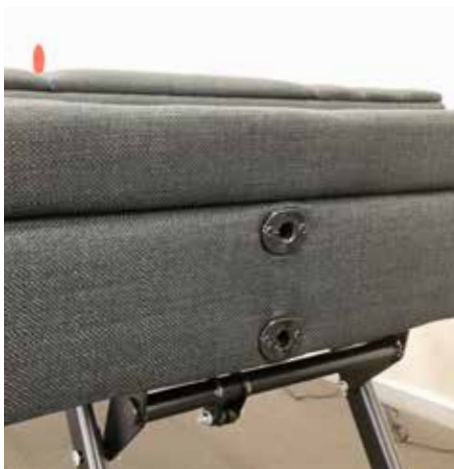
Locate mounting holes on bed frame