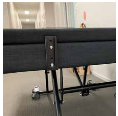
Use two short screws (5) to secure. Install the other bracket (4)