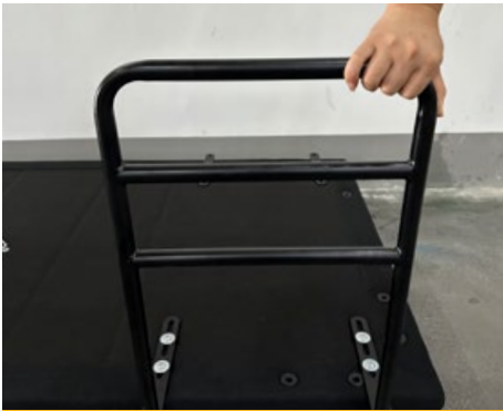
Place the assist rail (1) on top of the mounting holes on the connecting part (2) .