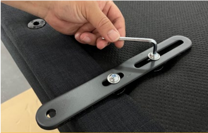
Tighten the screws with 5mm Allen key (3) .