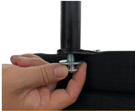
Connect assist rail (1) with connecting part using two sets of M10 screw (5) and big washer (6) .