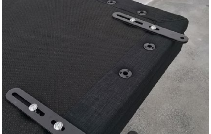
Mount the other assist rail connecting part (2) by repeating above steps.