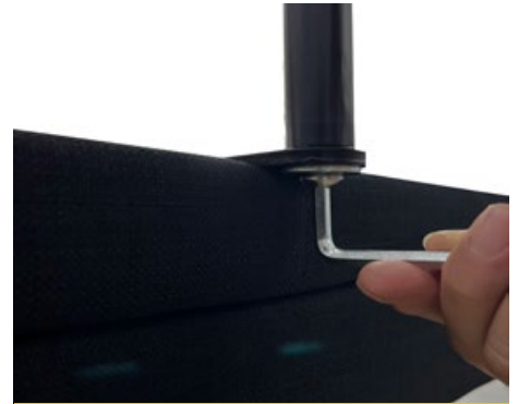
Tighten the two screws with 6mm Allen key (6) .