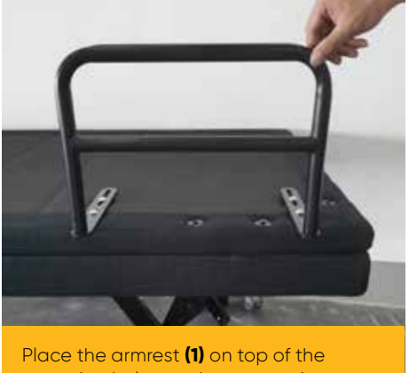
mounting holes on the connecting part (2).