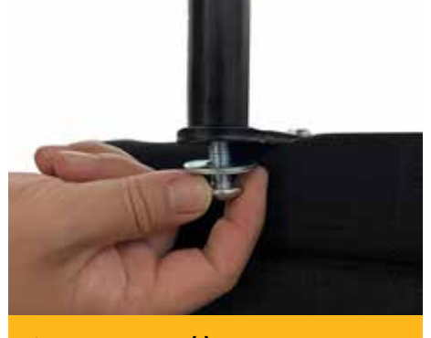
Connect armrest (1) with connecting part using two sets of M10 screw (5) and big washer (6).