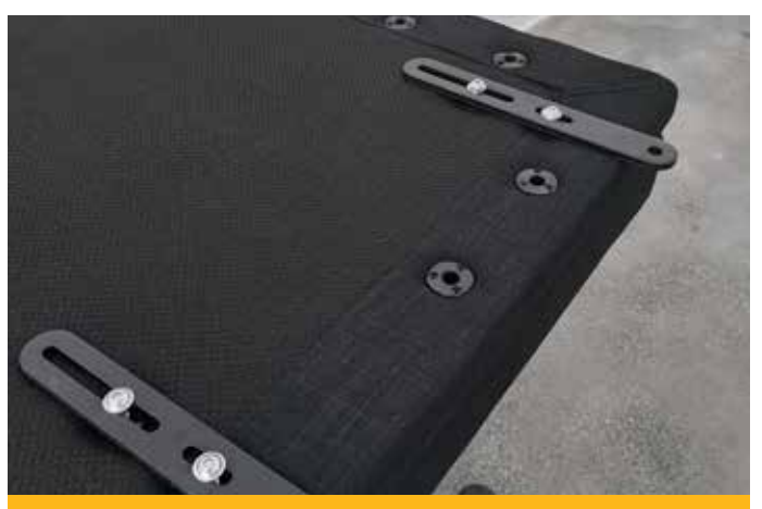
Mount the other armrest connecting part (2) by repeating above steps.