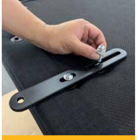
Use two sets of M8 screw (7) and washer (8) to fix one connecting part.