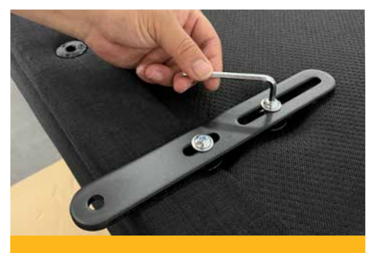
Tighten the screws with 5mm Allen key (3).