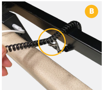
Step 4: Clip the tether ring on the tab of the adhesive (A). Place the other end of the tether around any preferred position of the bed frame or bedrail (image shows an example position) and clip the hook on the tether (B).