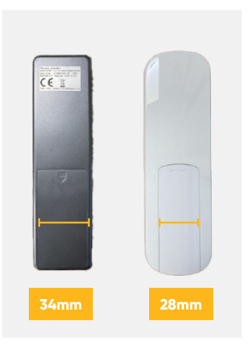
Step 2: Cut the Adhesive tape to the size of battery lid of your remote control. For the grey remote control, cut adhesive to 34mm . For the white remote control, cut adhesive to 28mm.