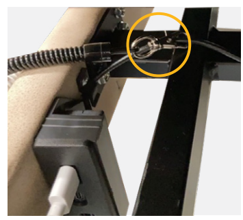
Another option is to clip the hook on the USB cable.