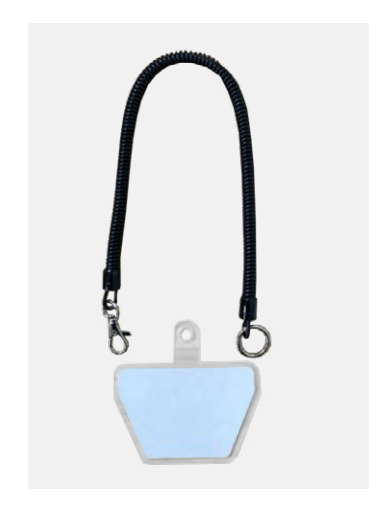
Step 1: Open packaging, ensure all parts shown above are included.