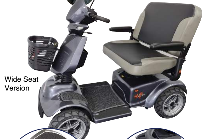
Wide Seat Version