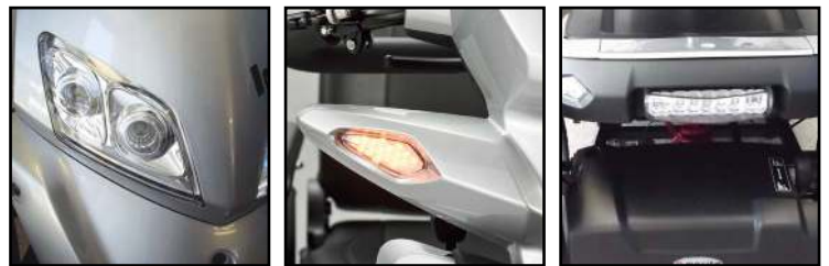
Modern LED lighting system delivers brilliant light with less power consumption