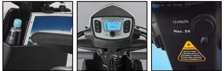
More space for storage