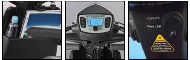
More space for storage