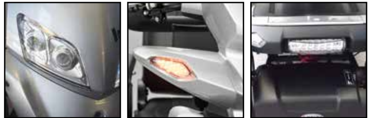
Modern LED lighting system delivers brilliant light with less power consumption